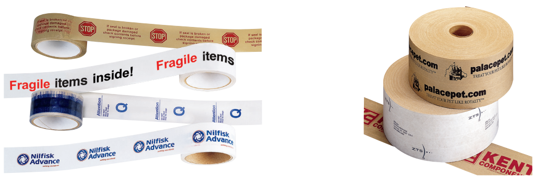
Call for details on custom print lengths, and to request tape samples.

Choose clear, tan, or white for Polypropylene or PVC tapes. Reinforced and Non-Reinforced gummed tapes are available in tan or white. Minimum order is one carton for Polypropylene and PVC tapes (three cartons for gummed tapes).